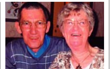
meet some of the people we've helped...

welcome to the new look 10th issue of the FTBA's newsletter