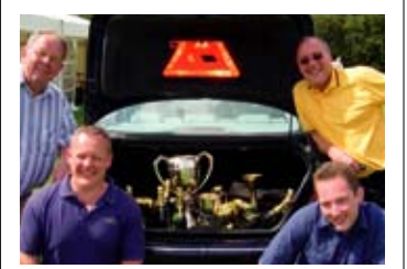
...and some of the great people who've helped us