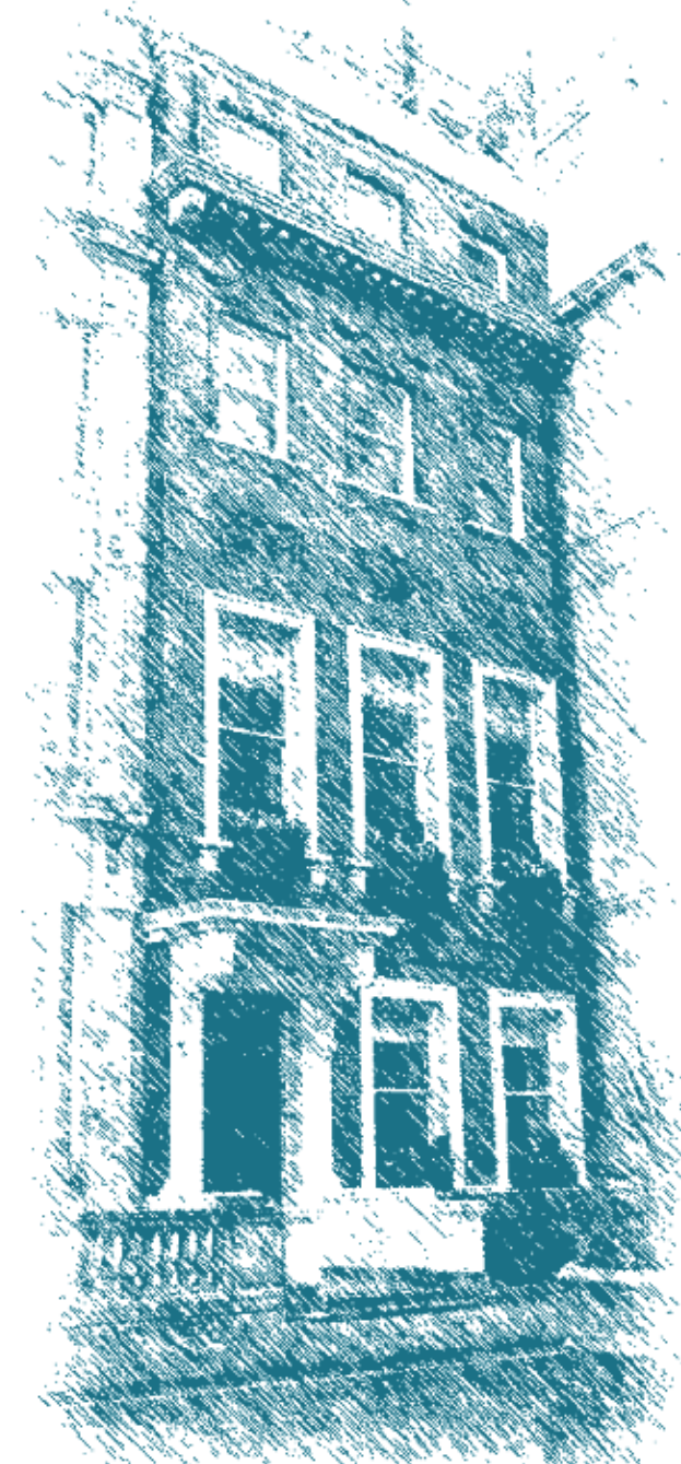
Furniture Makers' Hall – the home of the FTBA

welcome to the new look 10th issue of the FTBA's newsletter