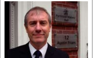
say hello to our new chief executive